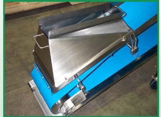
FITTED HOPPER MINIMIZES PRODUCT LOSS