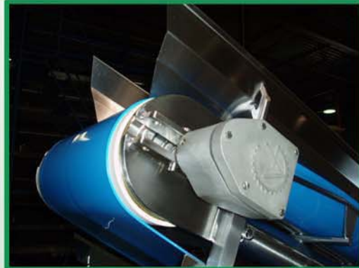
LOW-MAINTENANCE WASHDOWN PULLEY MOTOR