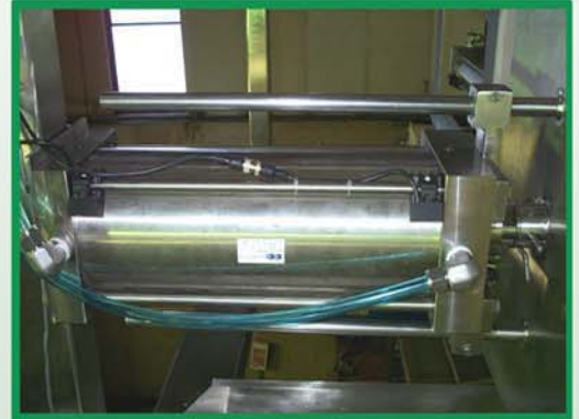
ALL STAINLESS STEEL PISTONS