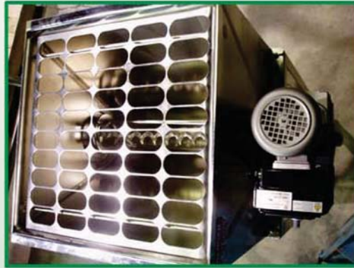
TOP VIEW WITH SAFETY GUARD