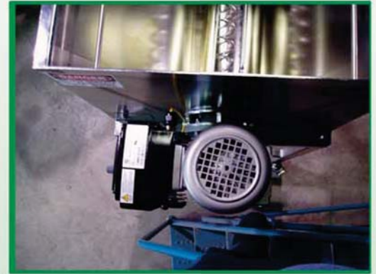
VIEW OF MOTOR AND DRIVE